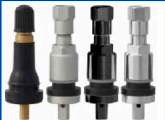
Snap Rubber Silver Metal Flat Metal Polished Metal

The quality of our valves is unmatched in the aftermarket. Our factory is one of the top 3 valve factories in the world, supplying OE valves to car makers with the highest QC standards.